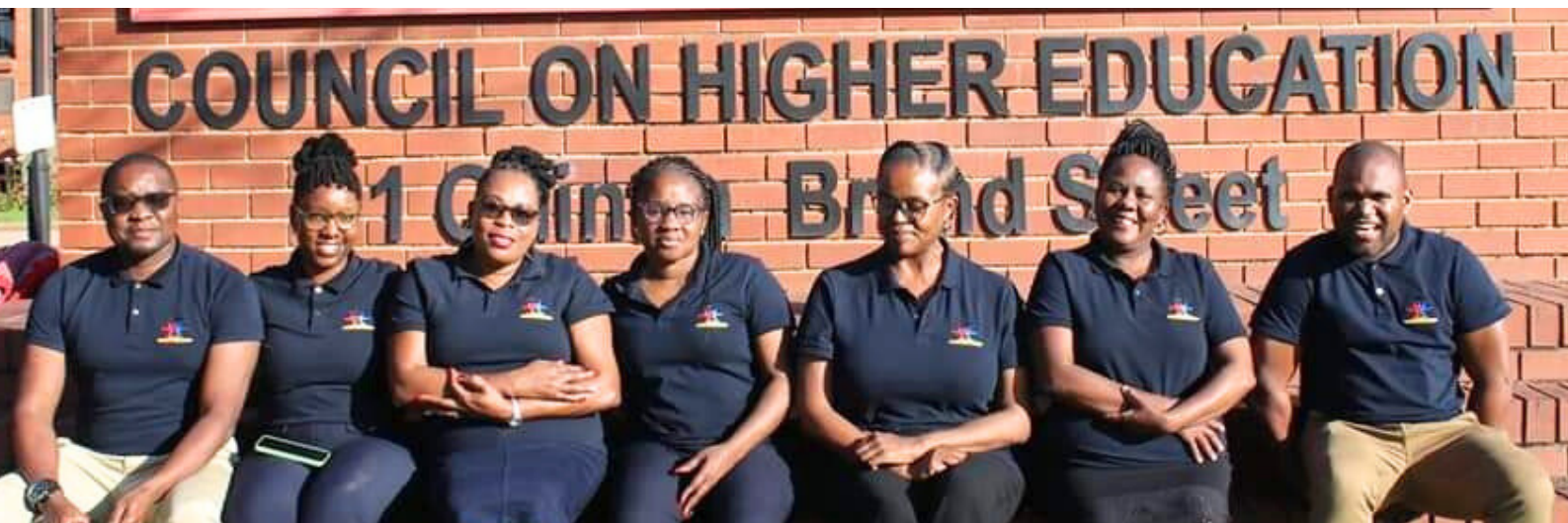
The ESHEC team after a visit to the Council on Higher Education Offices.