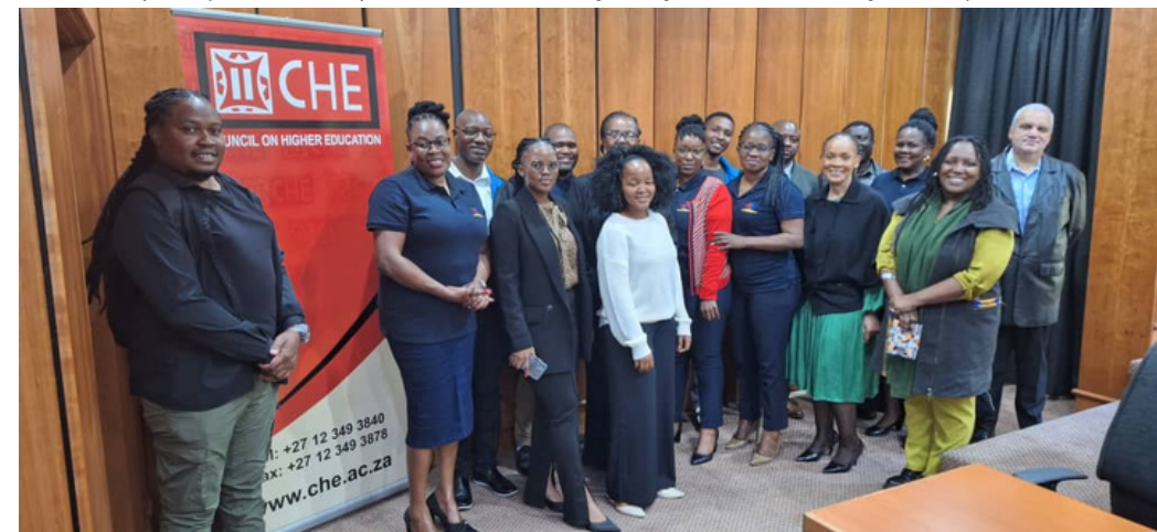
The ESHEC and CHE teams posing for a group picture.